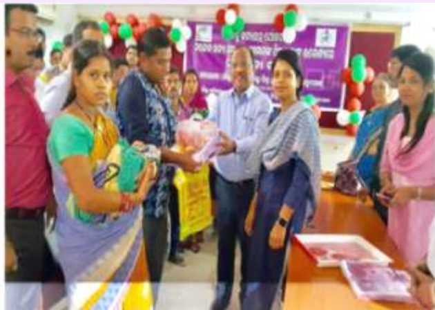
Felicitation of the parents of a new born girl child in Angul district

Felicitation of parents of new born girl child to celebrate the value of girl child was done at the district level. The parents of 3022 new born girls have been felicitated in District Head Quarter Hospital, Primary Health Centre, Community Health Centre of Angul district and Dhenkanal district.