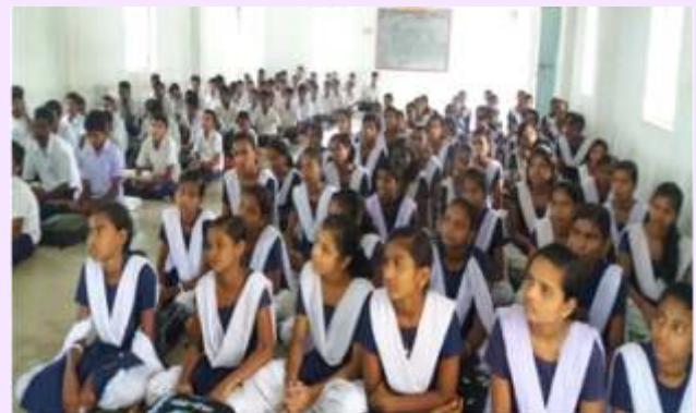
Gender sensitization workshop at Ganjam

Training & Capacity building is a key component of the scheme, not only of the government officials but also of the non government organizations, public, students, media persons, corporaters, traders etc. The District Administration of Angul, Dhenkanal