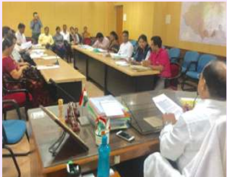
District Task Force meeting at Angul

District Child Protection Officer (DCPO)s being the nodal officers for the Scheme were reviewed at state level every quarter of the financial year. The DTF meetings were held monthly to review the progress under the chairpersonship of the District Collector. Similarly Block Level Task Force (BTF) has been constituted in all the blocks of the district under the BDOs and quarterly meetings were organized.