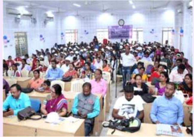
Observation of Girl Child Day in Angul

The International Girl Child Day on 24th January and International Women's Day on 8th March been celebrated at three districts under Biju Kanya Ratna Yojana with full of pleasure. All the frontline workers, school & college students participated.