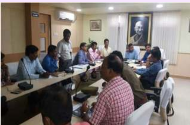
District Task Force meeting at Ganjam