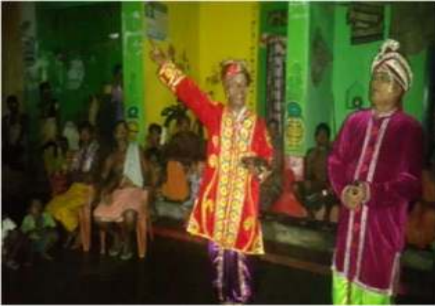
Nukhhad Natak in Ganjam

Rallies, torch marches were organised on International Girl Child Day on 24th January 2018 and International Women's Day on 8th March 2018 in the three districts where members of women Self Help Groups, Anganwadi Workers, ASHAs participated.