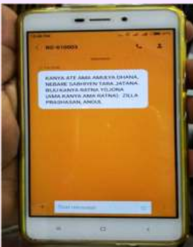
BSNL Bulk Message on BKRY

In Angul & Dhenkanal, BSNL bulk message have been successfully transmitted to 1 Lakh 40 Thousands BSNL users with a message of "Value of Girl Child" on the occasion of Rakhi Purnima and 1 Lakh 70 Thousand BSNL users on the occasion of Sishu Divas (Children's Day).