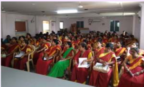
Sensitization workshop of frontline workers at Dhenkanal

and Ganjam have organised 585 such programmes for department officials, NGO functionaries, grass root level functionaries, AWWs, ASHAs, elected representatives, school teachers & students etc, in which a total of 45297 persons have participated. They were