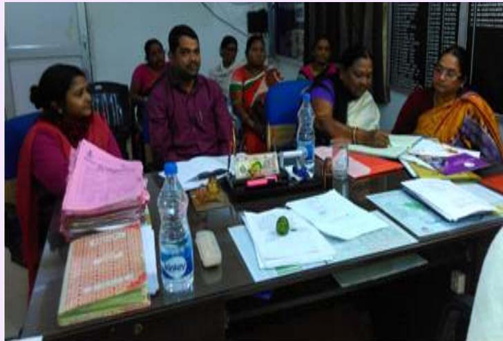
BTF Meeting at Dhenkanal