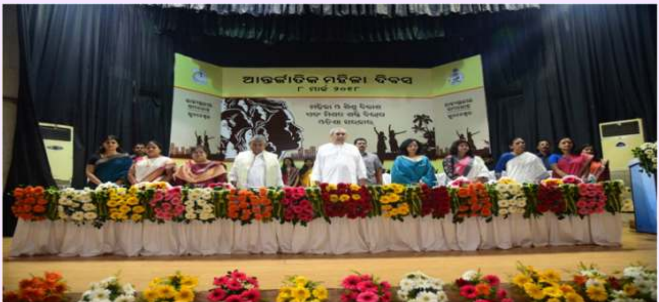
Observation of International Women's day in State