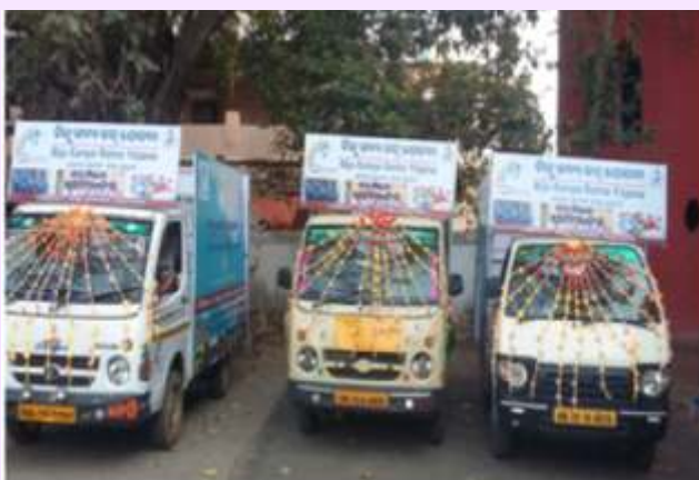
Campaign through Biju Kanya Ratha in Angul

"Biju Kanya Ratna week - The daughters of Odisha" was observed from 9th October to 14th October 2017 where members of Women Self Help Groups, Anganwadi Workers, ASHAs, Youths, students participated.