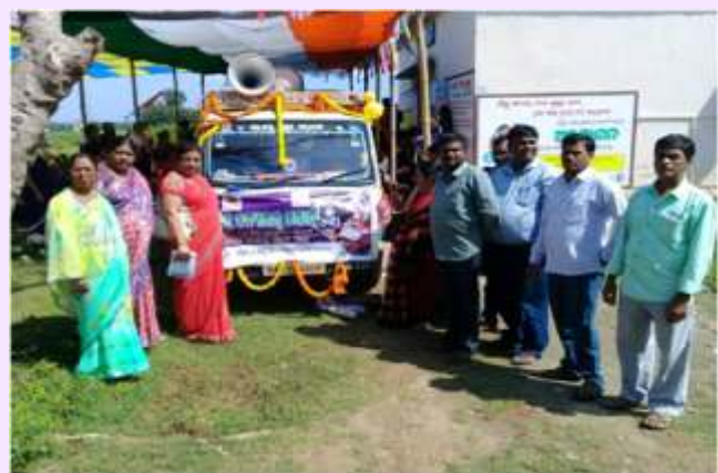
Campaign through Biju Kanya Ratha at Ganjam

Biju Kanya Rath in Dhenkanal, Angul and Ganjam covered the rural areas of the districts spreading the message of promotion of the value of girl child. Leaflets, brochures bearing the message on the issue of declining child sex ratio, elimination of discrimination against girls and women were distributed at community level. Street plays at strategic locations to build solidarity on addressing the issue of girls and women have been conducted.