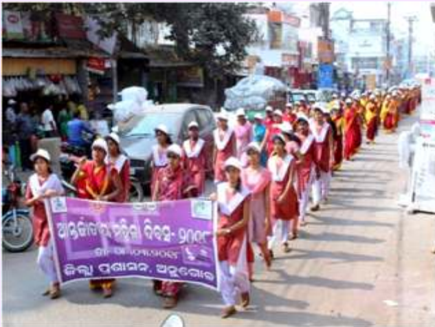
Observation of Women's Day in Angul