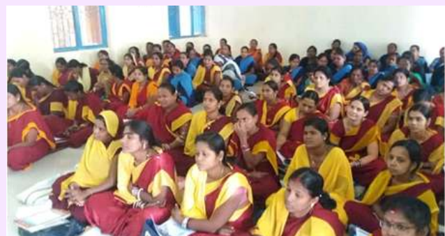
Sensitization workshop of frontline workers

To promote value of girl child 1400 youth were sensitized on gender issues through college level activities in 14 programmes in Berhampur University & Fakir Mohan University, Balasore.