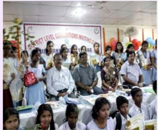
Observation of Girl Child Day in Dhenkanal