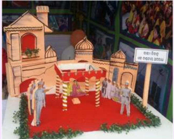
IEC stall installation at Beach Festival at Gopalpur on Sea, Ganjam