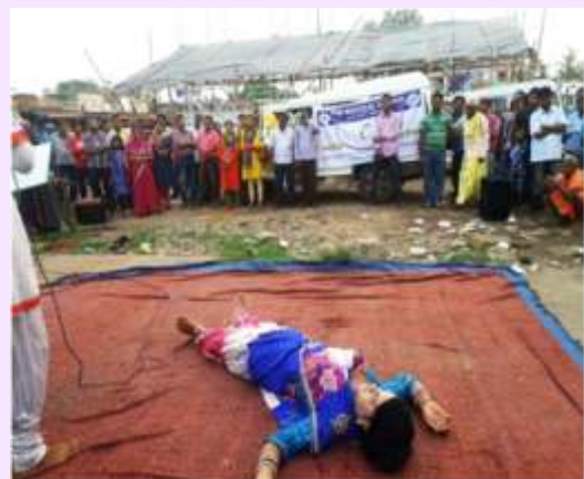
Street play on value of girl child at Angul

Special stalls, puppet shows, danda nrutya, painting competition, sand art and rally etc. were conducted during Zilla Mahotsav in Angul, Beach festival at Gopalpur-on-sea and Pallishree Mela and Jorandha mela at Dhenkanal district.