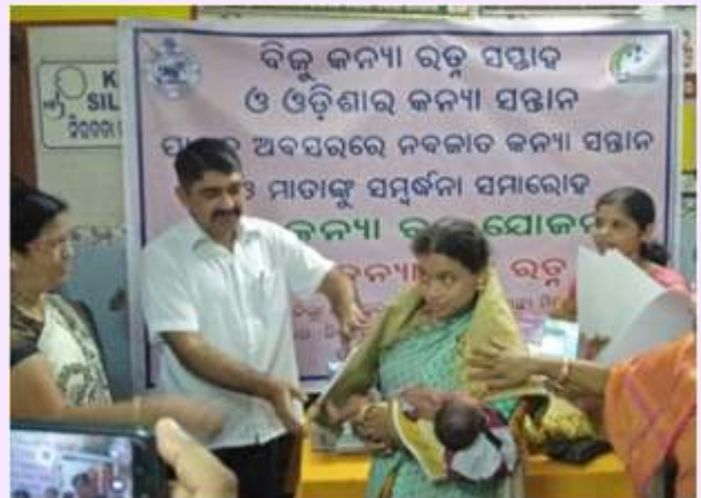
Felicitation of the parent of new born girl child in Dhenkanal