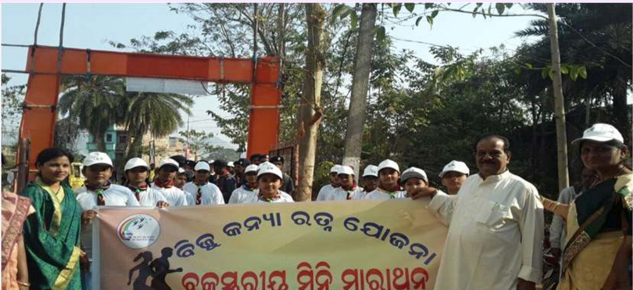
Mini Marathon in Ganjam