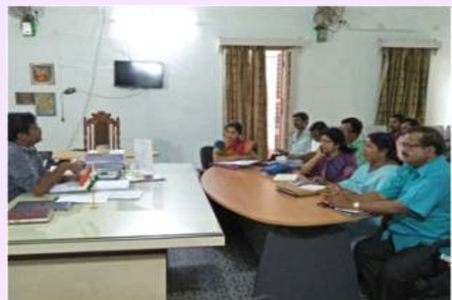
District Task Force meeting at Dhenkanal